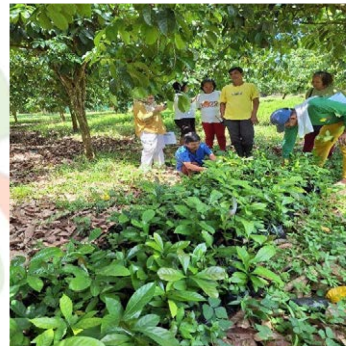
Site visit with cluster leaders and members of TARBAMC, produced 1,000 seedlings

The UGNAYAN platform is an important component of BAEP-LEAP in the Bangsamoro project, bringing together stakeholders for coffee in the provinces of Basilan and Sulu. It aims to improve network and allow regular coordination opportunities of different VC actors. They will jointly work