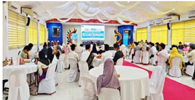
U-Report Now: Youth Pulse in Lanao del Sur, one of the spark session.

The European Union was funding MARADECA's three-month-long project, U-Report Spark session and Youth Pulse in Lanao del Sur, which took place from December 2023 to February 2024 in collaboration with UNICEF Philippine. The project was centered on protecting children and encouraging youth people to actively contribute to the growth and peace of their communities. The U-report is a digital messaging platform that empowers youth and encourage them to talk about issues that are important to them.