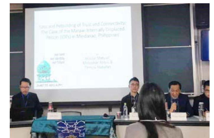
The 3rd Islamic Trust Studies International Conference