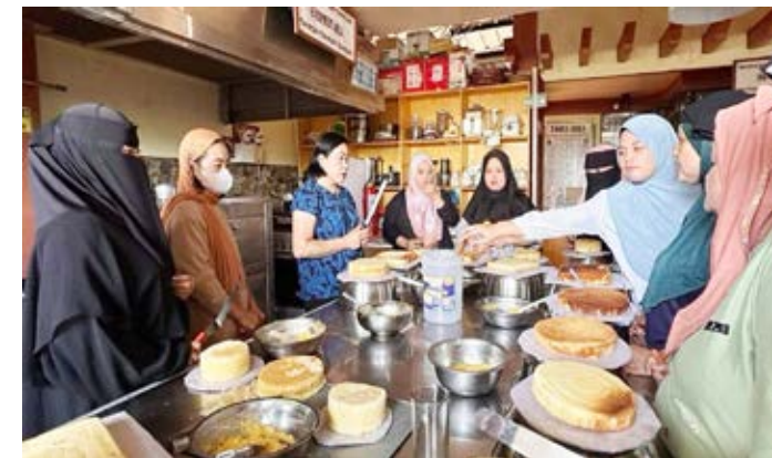
Training for baking, bread and pastries enterprises

Five cooperatives from several towns in Lanao del Sur received a livelihood grant from MARADECA's Enhancing Food Security and Livelihood in the Bangsamoro project which was implemented in collaboration with the United Nations Development Program.