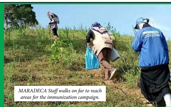
MARADECA Staff walks on far to reach areas for the immunization campaign.

In the far-flung barangays of Lanao del Sur, the distance from city health units and rural health centers makes it difficult for parents to bring their children in for routine immunizations. The challenges are compounded by limited information about the benefits of immunization, fear of potential side effect of vaccines, and worries about transportation expenses. These challenges have contributed to lower immunization rate in the areas.