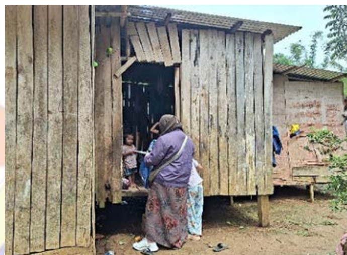
MARADECA and PLAN Pilipinas International on Door-to-door Probability Poverty index Survey

The aim of the PPI was to examine the position of individuals in the community and the result will guide the team in selecting appropriate families for the child sponsorship program. The chosen children will serve as ambassadors to their respective communities, allowing the program planned that benefit them to be introduce to their community.