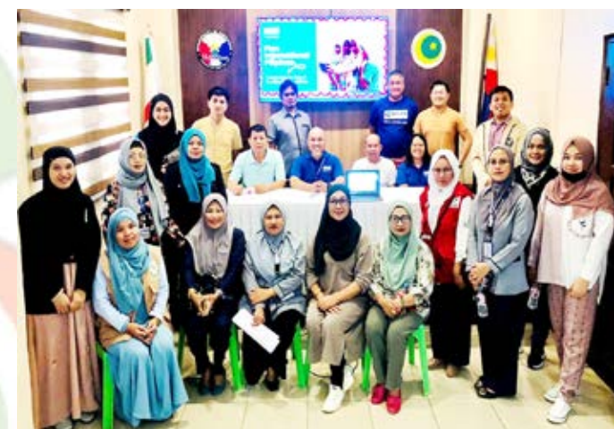
Courtesy meeting with Saguiran MLGU

Plan International Pilipinas and Maranao People Development Center Inc. (MARADECA) have joined forces