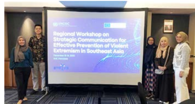
Regional Workshop in Bali, Indonesia

Violent extremism is a worldwide concern, it threatens peace and tolerance. Countries worldwide are working tirelessly to prevent the spread of violent extremism. Ideologies that promote radicalism and use extreme force to achieve their mission is the root cause of violence, not inherent in individuals for no one is born violent.