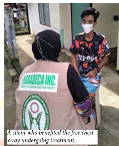
A client who benefited the free chest x-ray undergoing treatment.

MARADECA in partnership with Philippine Business for Social Progress (PBSP) and Global Fund, through their long-running project, Advance Client-Centered care and Expanding Sustainable Services for Tuberculosis (ACCESS-TB) has been working to reduce TB utilizing ACF methodology. The ACCESS-TB project provides diagnostic and treatment services to both drug-susceptible and multi drug resistant TB (MDR-TB) cases, expanded access to hundreds of MDR-Tb diagnostic and treatment center, engaged thousands of private doctors,