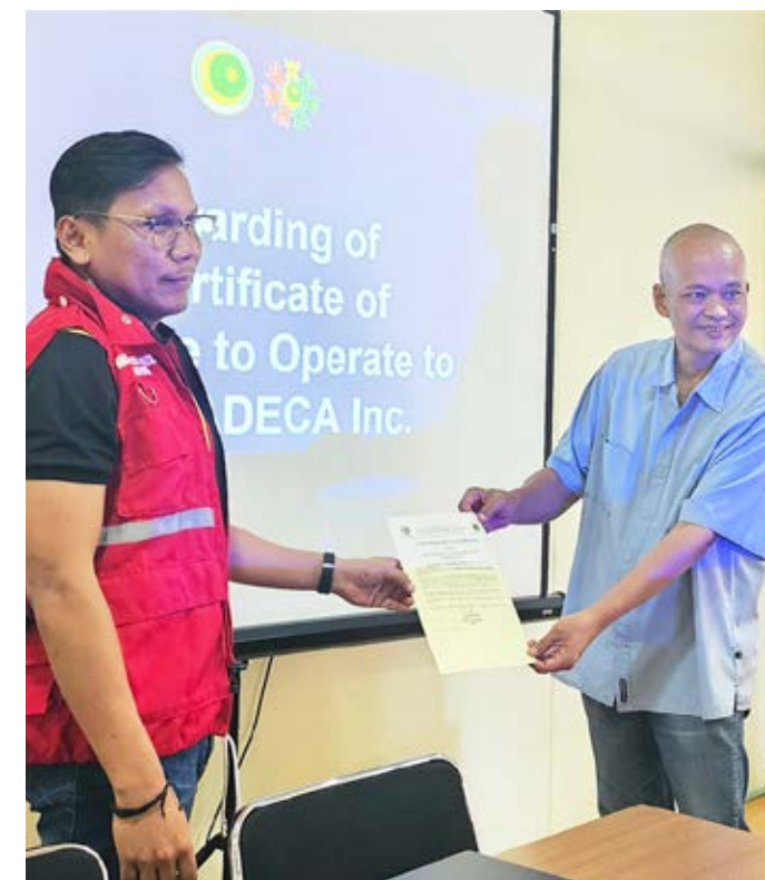
MARADECA CEO receiving the award of Certificate for License to Operate as a social welfare development agency from the Ministry of Social Services and Development (MSSD)-BARM