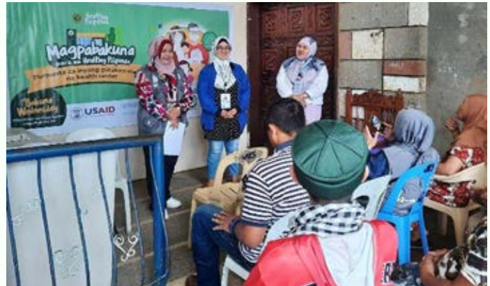
Focus Group Discussion (FGD) at Bario Green, MC November 28, 2023

FGDs project demonstrated the value of community engagement in public health. Prioritizing education and dialogue provide groundwork for brighter and healthier future.