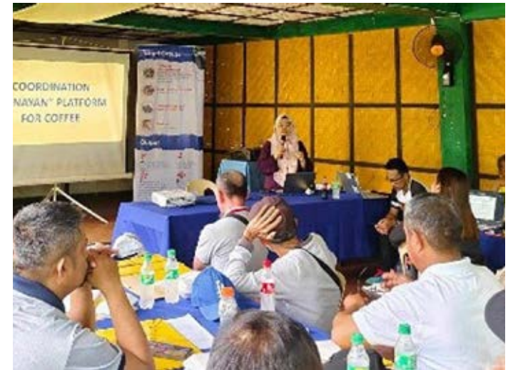
Ugnayan Platform in Basilan

From the first meeting, several VC stakeholders presented programs, projects, and coffee related activities. These became opportunities to share coffee current plans and