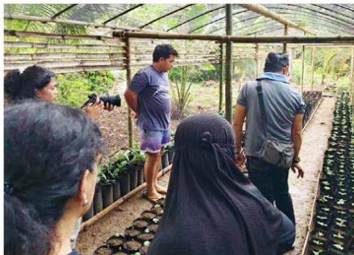
Field visit with PIN at Coffee farm in Bgy. Maluso, Basilan

LEAP is a three year long project of Maranao People Development Center (MARADECA) in partnership with People in Need (PIN) funded by European Union (EU) through the Bangsamoro Agri Enterprises Program (BAEP). The projects aimed to improve the quality and diversity of coffee and seaweeds production in the island provinces of Sulu and Basilan.