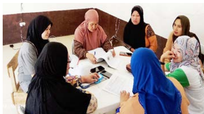
Mentoring and Coaching: Marantao, Lanao del Sur

In an effort to empower Civil Society Organizations (CSOs) and enhance their capacity for sustainable development, the project team conducted mentoring and coaching activity. This initiative focuses on the implementation of the Funding Support to Third Parties (FSTP1) and registration