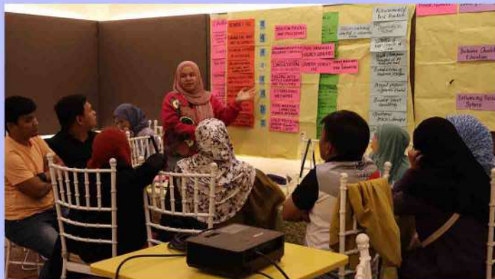
Plan and MARADECA strategic planning at GO Hotel, Iligan City

The Plan International- Pilipinas and the MARADECA Inc. recently embarked on a joint strategic planning session for their Child Sponsorship Program, a testament to their commitment to improving the lives of the children in Lanao del Sur. The three-day session, held on October 22-24, 2024 at Go Hotel in Iligan City, brought together 28 program staff and heads from both organizations. This strategic planning initiative was a crucial step towards ensuring the smooth and effective implementation of the child sponsorship program, which covers the municipalities on Marantao and Saguiran, Lanao del Sur.