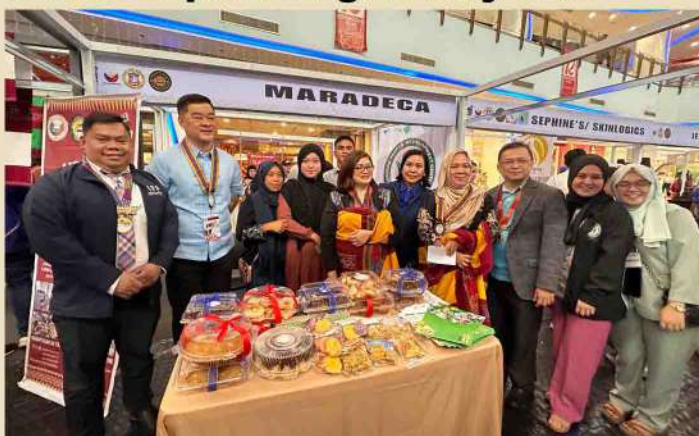
Maranao delicacies showcased during Halal Trade

MARADECA proudly served as one of the sponsors of the inaugural Halal Trade Expo in Iligan City, held from July 23 to 27, 2024, at Robinsons Mall. Organized by the Department of Trade and Industry-Iligan (DTI-Iligan) in partnership with the Iligan Hotels, Resorts, Restaurants, Cafes, Culinary Schools