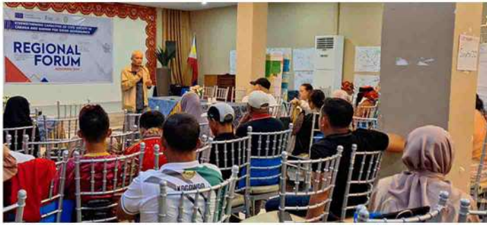
MARADECA CEO speaks on the importance of partnership in development during CSO-LGU partnership regional forum

"The development, if we look at it, cannot be considered true development without participation. The people must be involved in building and shaping the development of our community, including the government and the citizens. So, if we look closely, there must be collaboration between Civil Society Organizations (CSOs) and the government."