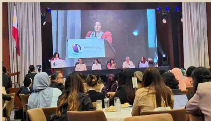
Women Conference on Global Peace and Security

The conference brought together government, civil society, and international organizations to address the critical role of women in shaping peace and security worldwide. The conference aims to show how women contribute in solving conflicts, building peace, and keeping long term security in countries after conflict.