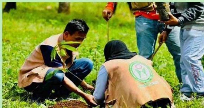
MARADECA's Staff joined tree planting with PENRO

Conserving water and reducing waste, protecting and restoring habitats are among the practices that could minimize harm to environment and promote conservation and renewal of natural resources. These practices support Goal 13 and 15 of the Sustainable Development Goals (SDG) proposed by the United Nations (UN) and adopted by the UN General Assembly in 2015.