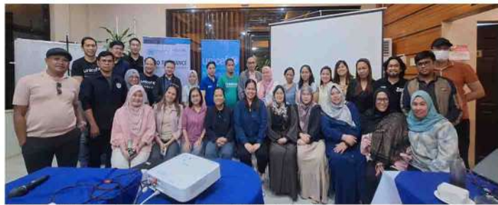
CSO participants during the HACT and E-Tools Training

MARADECA administrative staff, finance officers, and project officers participated in the two-day refresher training on Harmonized Approach to Cash Transfer (HACT) and e-Tools in November 19-20 2024 at Paragon Hotel and Restaurant, Cotabato City. The training was part of UNICEF 2024-2028 Country Program. The HACT training focuses on partnership agreements, risk assessment, cash transfer