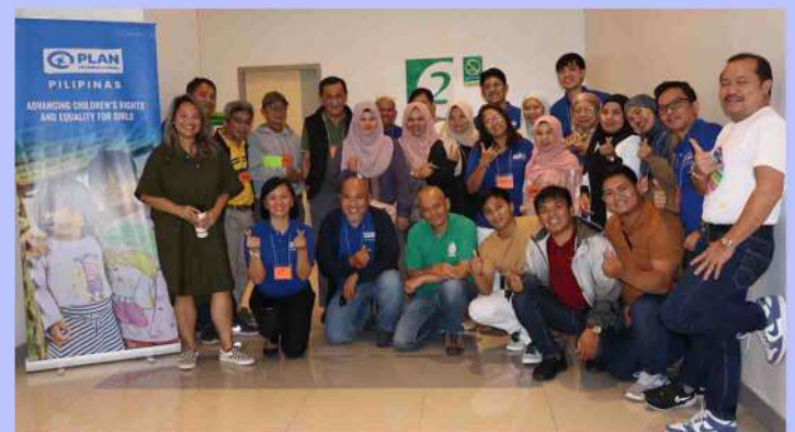
Plan, MARADECA Staffs and Management during the strat plan.

MARADECA and Plan International Pilipinas, long-term partners in community development in the province, have entered into a 15-years partnership for this program, marking a significant commitment to improving the well-being of children in the area. The strategic plan aims to develop comprehensive strategies, actions, and activities that address the identified needs and concerns of the target communities. This collaborative effort allows participants to