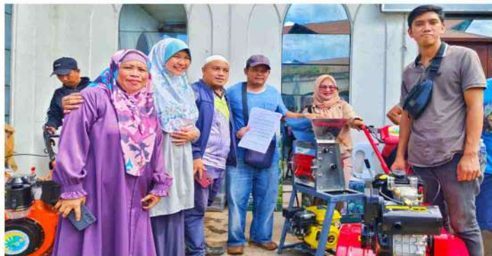
Turnover of Coffee Machineries and Coffee de pulper

The Ministry of Agriculture, Fisheries, and Agrarian Reform-Basilan (MAFAR-Basilan) delivered two types of coffee machines to the group of coffee farmers in Barangay Boheywas, Lamitan City and in Barangay Tubigan in Maluso, all in the province of Basilan. The De pulper machine remove the fleshy pulp from coffee cherries while the De huller machine strip away the dried outer husk of coffee beans. The delivery of the said machines is consistent with the commitment of the MAFAR in revitalizing the local coffee industry.