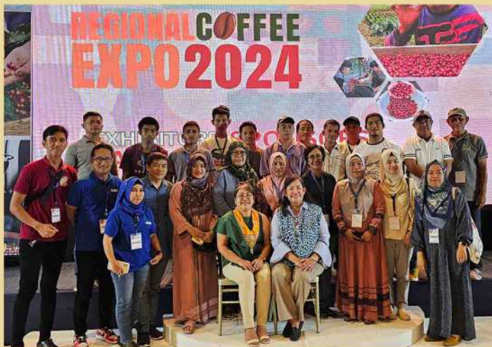
Delegates of Regional Coffee Expo 2024

Twenty-three coffee farmers from Basilan and Sulu were sent for an exposure visit to coffee farms and processing facilities in Davao del Sur from September 18-24, 2024 to introduce them to quality coffee farming, appropriate technologies and coffee-processing facilities. The visit also provided them opportunity to establish network with potential coffee buyers.