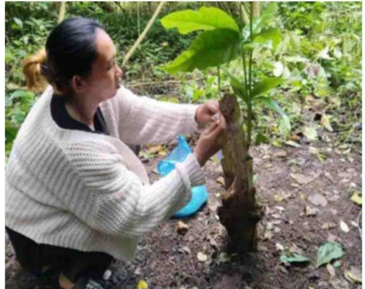
One of the farmer in Barangay Kabbon Takas in Patikul, Sulu during the coffee rejuvenation training.

To make the trainings more convenient and accessible for coffee farmers, they were conducted in several occasion, from July 6 to 13 in Barangay Kabbon Takas in Patikul, Sulu, from July 14 to 16 In the Barangays of Buhanginan, Limping Pighi, Daho in Sulu, and in July 17 in Barangay Tagbak, Sulu.