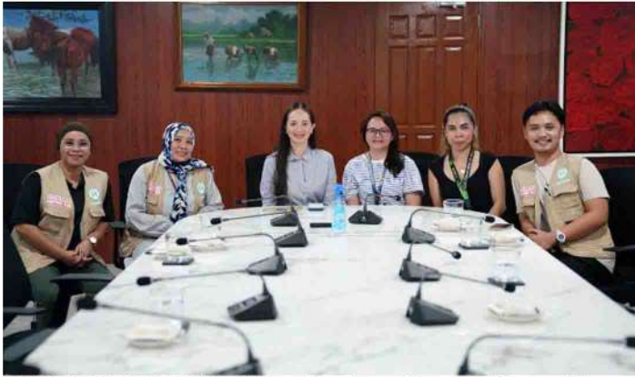
MARADECA staff with Hon. Mayor Lucy Torres Gomez at Ormoc City

The incumbent Mayor of Ormoc City, Lucy Torres Gomez find time to sit down with MARADECA Team to discuss the ACCESS TB Program in the City. The said meeting was held at the Conference Room of the Office of the City Mayor.