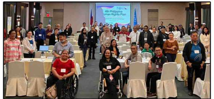
Delegates of 4TH Philippines Human Rights Plan 2024

The CDO regional consultations was the first of three island-wide consultation to create an inclusive process for the gathering input from a broad spectrum of human rights advocates to contribute to