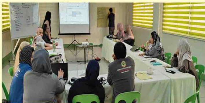
MARADECA during HR Development Summit

The Human Resource Development Summit convened last July 27-28, 2024 at Ragayan Training Center, Ragayan Poona Marantao, Marantao, Lanao del Sur. The organizing of the high-level meeting is consistent with traditional practice of MARADECA of holding intermittent meeting to keep the organization and staff updated with the developing changes and trends in the environment that directly or indirectly affect the operation and management of the organization.