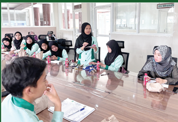
A young leader from Butig steps up, offering bold ideas for child protection in youth discussions.

MARADECA Inc., in collaboration with LYDOs, SK Federations and youth networks gathered a group of youth in Lanao del Sur to explore and discuss sensitive issues like child and teen marriages and children’s rights.