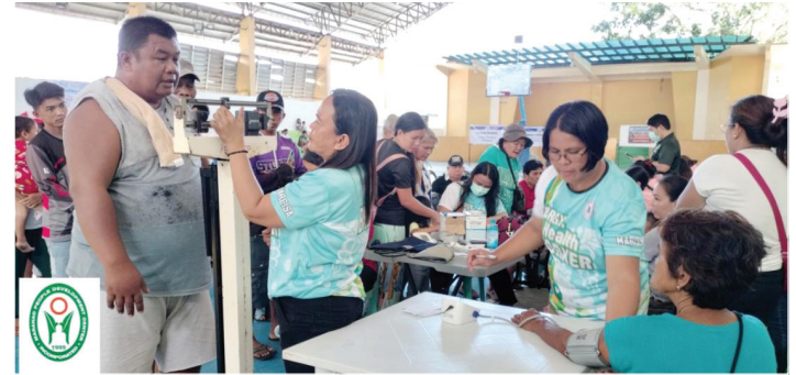
Active Case Finding (ACF) in Cebu Province