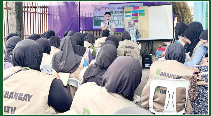
MARADECA staff and CHWs in Pagayawan, Lanao del Sur

“In our communities, trust is the foundation. When a mother sees that we respect her culture and listen to her concerns, she becomes more open to protecting her child through