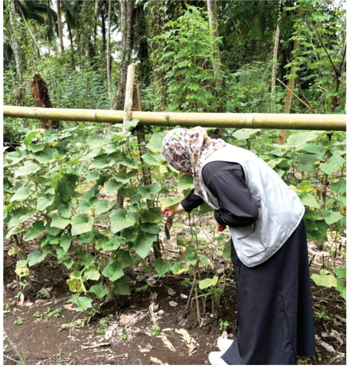
MARADECA staff assessing farmers for vegetable farmland suitability

After these preparatory activities, a package of agricultural support will be rolled out, including the distribution of vegetable seeds, organic fertilizers, and farming tools, to help flood-affected families restore their sources of income and food security through sustainable vegetable production.