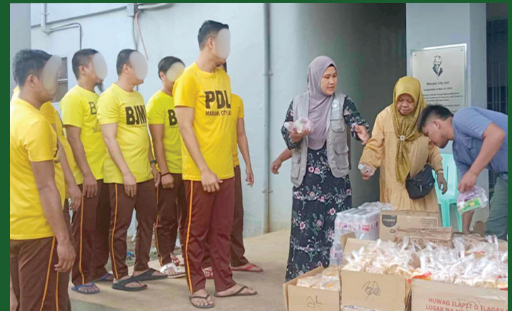
MARADECA’S Iftar Drive for PDLs in Lanao del Sur