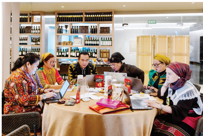
Philippine team refines evaluation findings to reflect accuracy, insight, and integrity

The ASEAN RPA on WPS was attended by delegates from the Philippines, Thailand, Indonesia, Cambodia, and Vietnam.