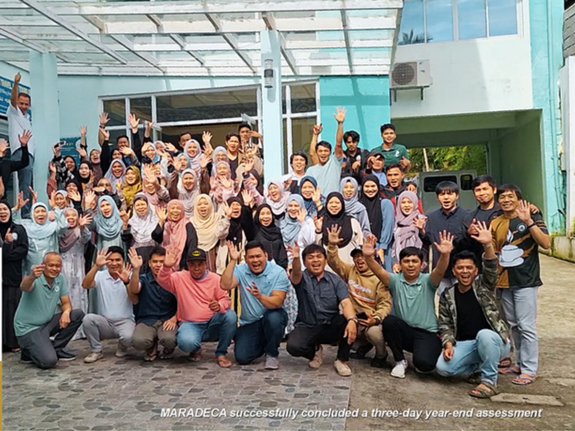
MARADECA successfully concluded a three-day year-end assessment

F rom December 15-17, 2025, MARADECA conducted its three-day Year-End Assessment at Ragayan Training Center in Poona Marantao, Lanao del Sur. The assessment reviewed completed and ongoing projects, assessed organizational performance, and set programmatic directions for 2026.