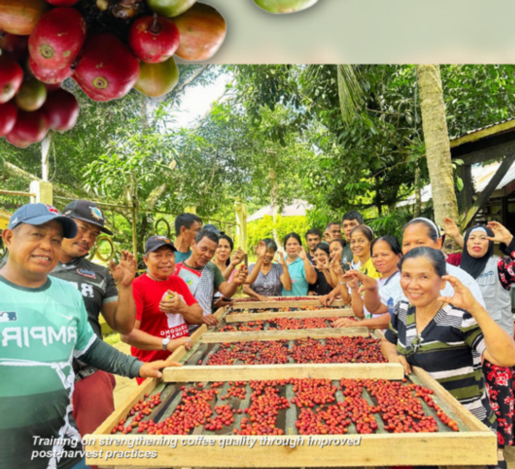
Training on strengthening coffee quality through improved post-harvest practices