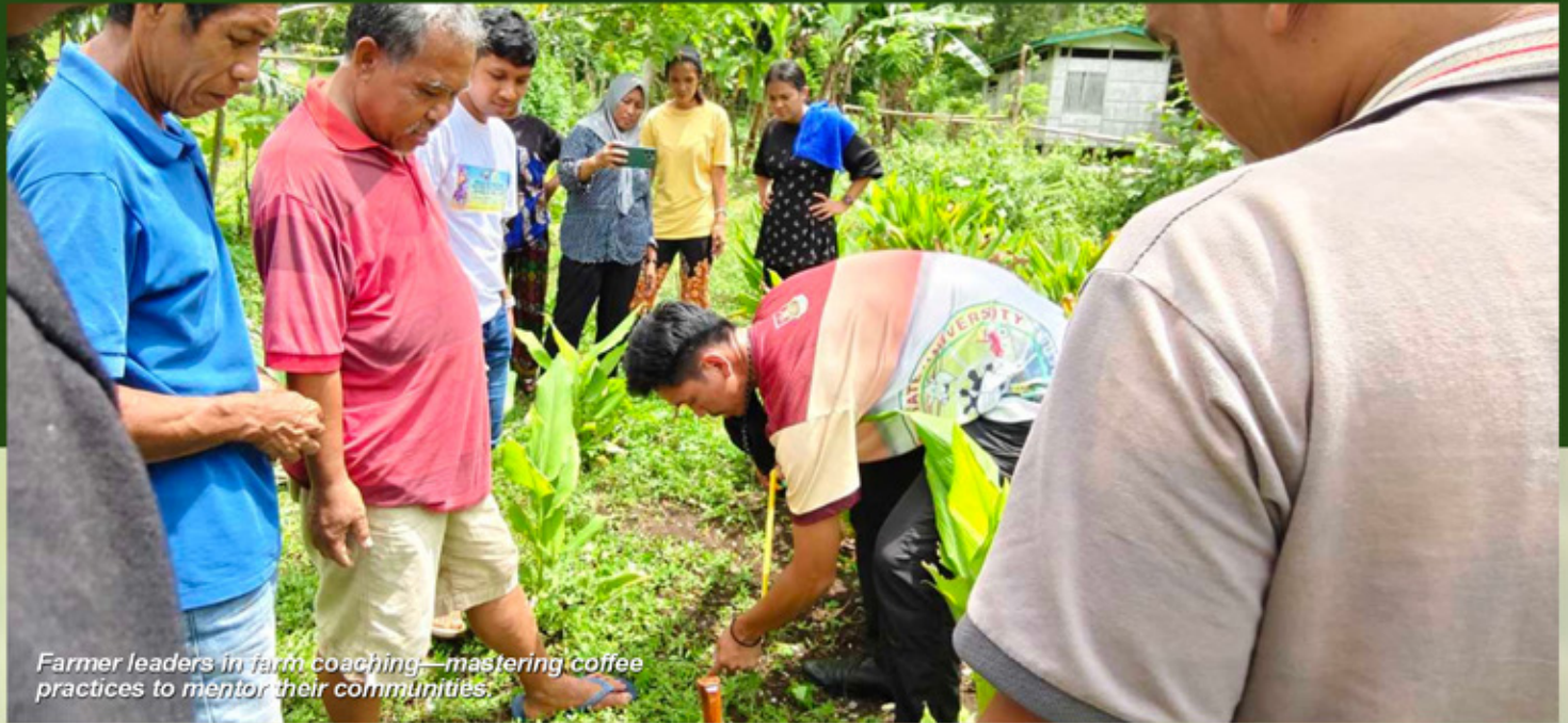
Farmer leaders in farm coaching—mastering coffee practices to mentor their communities.

Coaching farmers in Agri-aqua project is essential for successful knowledge transfer of integrated farming techniques, enabling behavior change from traditional methods, providing real-time problem-solving support, building confidence in new practices, and ensuring long-term sustainability of the system, ultimately leading to improve productivity, food security, and farmers income.