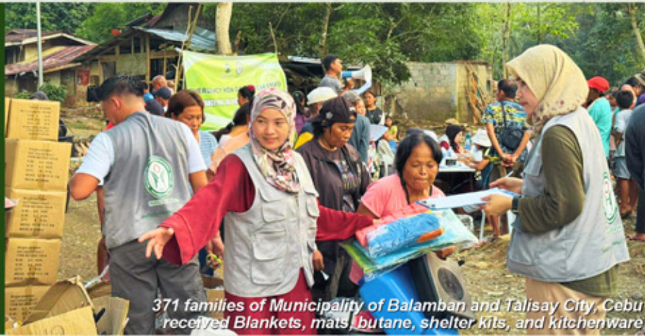
371 families of Municipality of Balamban and Talisay City, Cebu received Blankets, mats, butane, shelter kits, and kitchenware

“ I am happy because someone helped us today, as life has been very difficult for us after Typhoon Tino. We are truly grateful to you for giving assistance. Without this support, life would be even harder for us because we have no jobs and I am already old.” – A resident of Barangay Cabagdalan.