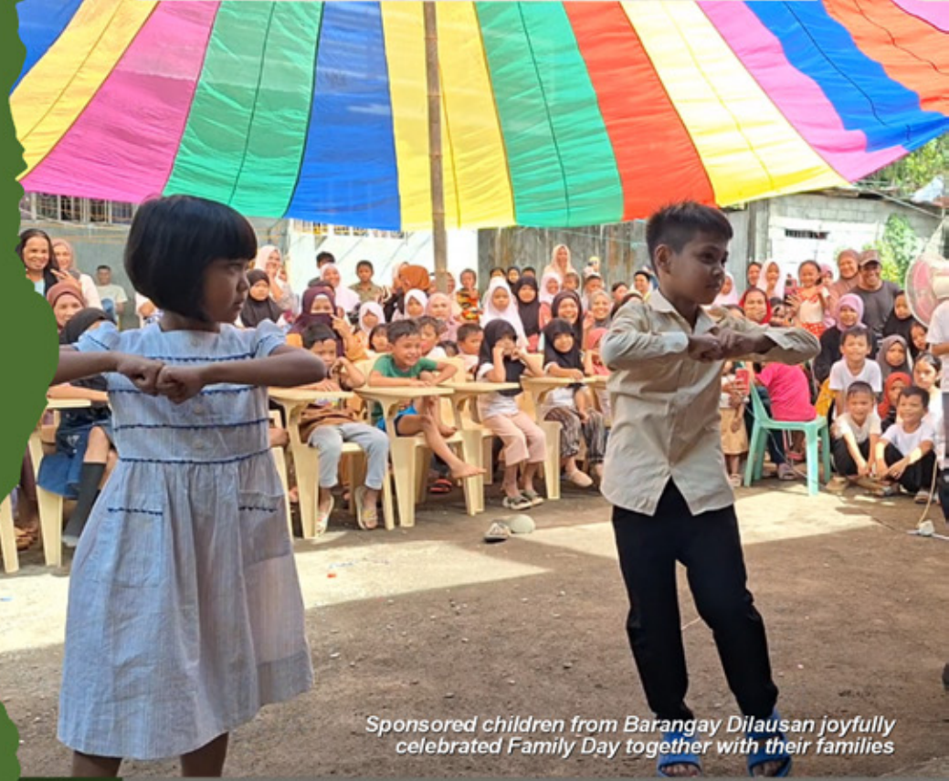
Sponsored children from Barangay Dilausan joyfully celebrated Family Day together with their families