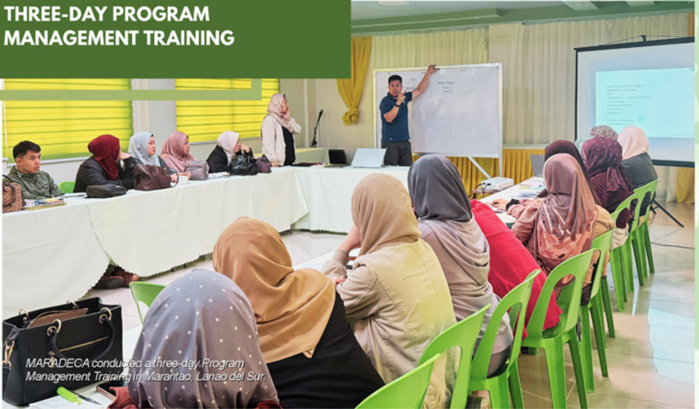
MARADECA conducted a three-day Program Management Training in Marantao, Lanao del Sur.