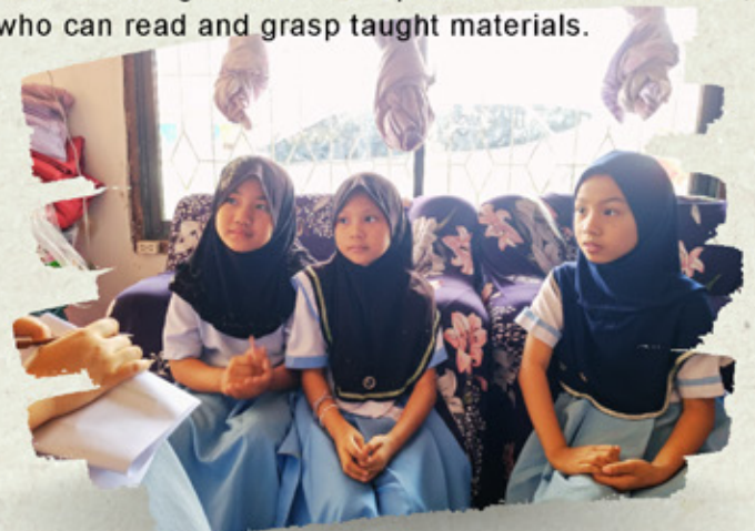
Three mentees from Pugaan Elementary School who shared their sentiment and gratitude to the program.

The remarkable transformation is more than academic progress; it is testament to how dedicated mentorship can nurture learner potential and ignite the future of those who will hold community development in their hands. The success is due to the tireless effort of two inspiring sixth-grade mentors who revealed that few learners could read before the program's intervention. Now they proudly witness the gradual development of their mentees, who can read and grasp taught materials.