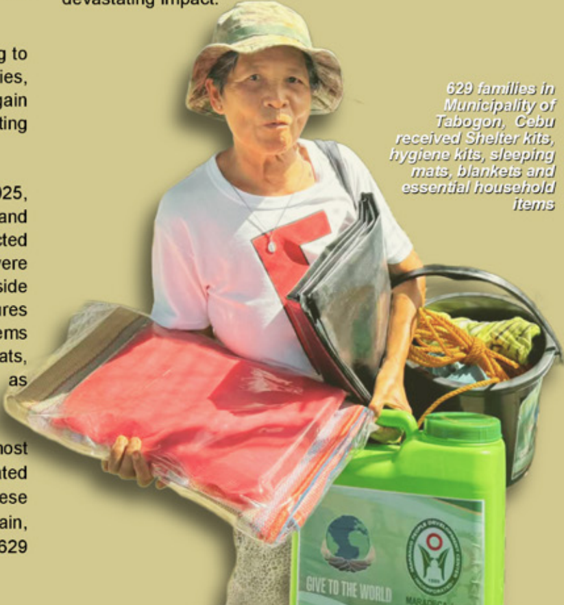
629 families in Municipality of Tabogon, Cebu received Shelter kits, hygiene kits, sleeping mats, blankets and essential household items

Maintaining its commitment to reach even the most marginalized communities during every disaster, coordinated closely with local officials to ensure aid reached these remote areas. Despite the distance and challenging terrain, the teams successfully delivered assistance to all 629 families in need.