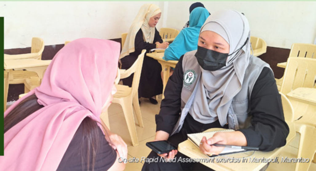
On-site Rapid Need Assessment exercise in Mantapoli, Marantao

For years, MARADECA has maintained a dedicated Emergency Response Team, consistently responding to disasters affecting vulnerable communities. Effective humanitarian assistance requires constant professional development, which led to the latest Capacity Enhancement Training on Disaster and Emergency Response held at Ragayan Training Center from September 15-17, 2025.